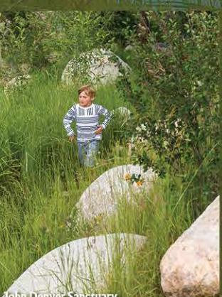
John Denver Sanctuary

Aspen's Open Space Program preserves and restores open space throughout and beyond the city. With over 1,000 acres of land preserved you'll find a variety of environments and natural areas, from wetlands to forests. The open space parcels around Aspen show the communities commitment for the environment.