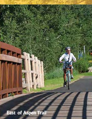
East of Aspen Trail

Aspen's Trails include twenty plus miles of impeccable paths and trails throughout the downtown core and surrounding areas! Our trails offer broad transportation and recreational opportunities. If you ask a local, they'll steer you to the great singletrack trails of the Hunter Creek-Smuggler Valley, or the scenic views of Aspen from the Ajax Trail. You can also rent a bike and cruise along any of the Family Friendly Paths outlined in our guide. Don't forget the Aspen Recreation center, and visit the Aspen Parks and Recreation website for a complete list of activities and opportunities in the area.